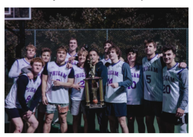
Greek Basketball Association Champions (Nov. 2023)

The semester began with recruitment during the first two weeks. The chapter hosted 6 events, including one summer event in Indianapolis and attracted a large number of rushees. The summer event was successful, with 51 rushees attending this event. With a new rush process imminent, the chapter intends to continue summer events in