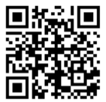
Pig Dinner RSVP Form https://tinyurl.com/PigDinner2023

scanning the QR code to the right and completing the google form.