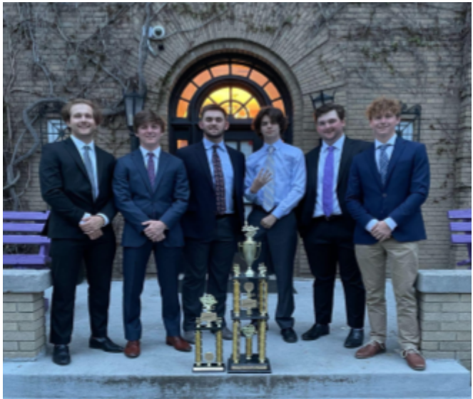
Fiji Racing Team with their Trophies, Apr. 2022

With one year under our belts, the Fiji Racing team looks forward to next year’s Grand Prix and has a podium finish in sight.