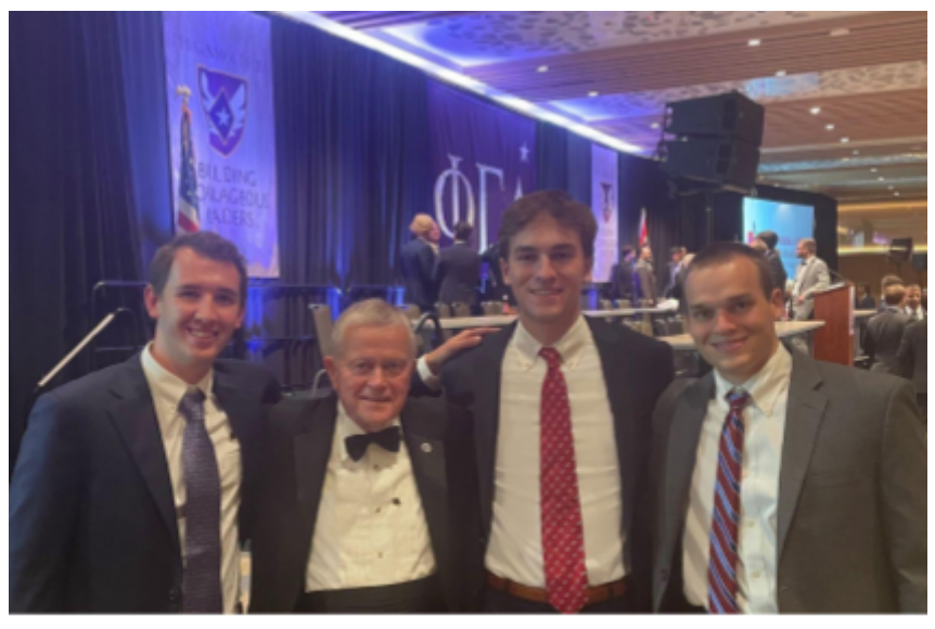
Lambda Iota Delegates at the Ekklesia, Aug. 2022

Leading up to the 174th Ekklesia there was a lot of evidence that changes needed to be made in the pledge ship program from a national perspective. In the proceeding four years 15 chapters had been closed and our national insurance carrier had paid $10.2 million in claims while collecting only $4.5 million in premiums. Thus our insurance company demanded major changes be made to the new member education process to reduce risk. Fortunately Lambda Iota had already started down a path to reduce risk years ago. We will have to make further changes but not to the extent of some chapters.