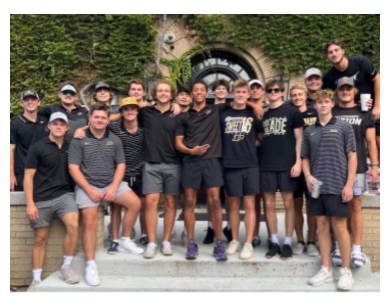
PC24 before the Penn State Football Game, Sep. 2022

The Fall of 2022 is poised to be a great one. Both the Cabinet and the Chapter are excited to make the most of their first COVID restriction-free semester. Many brothers had internships and summer jobs, but still made time to plan ahead for an eventful Fall semester.