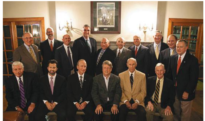
Fijis at Mitch Daniels' initiation, 2013