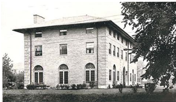
640 Russell Street: 1926 and now...

The newly chartered Alpha Graduate Chapter quickly went into action. The first property purchased was a lot on North River Road in